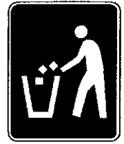
D9-4 Litter Container