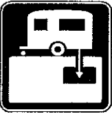
D9-12 RV Sanitary Station