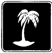
D5-12 Interstate Oasis