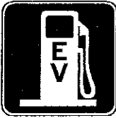
D9-11b Electric Vehicle Charging