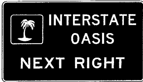
Figure 2F-4. Examples of Interstate Oasis Signs