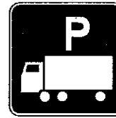
D9-16 Truck Parking