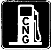
D9-11a Alternative Fuel