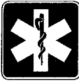
D9-13 Emergency Medical Services