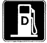
D9-11 Diesel Fuel