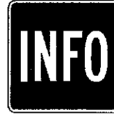
D9-10 Tourist Information