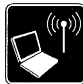
D9-22 Wireless Internet