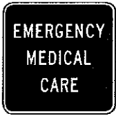
D9-13c Emergency Medical Care