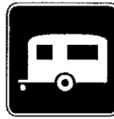
D9-3a Trailer Camping