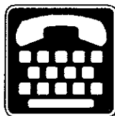
D9-21 Telecommunication Device for the Deaf