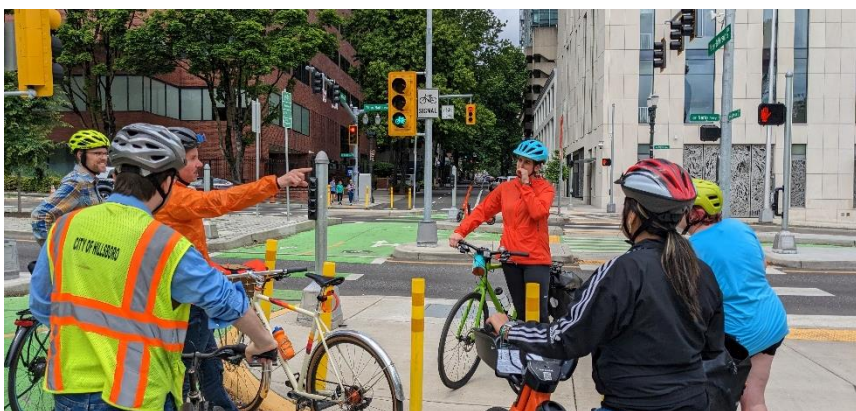
Better Naito Forever bike tour 2022